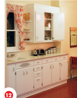
12 Koki nogom eh ija madizinanok