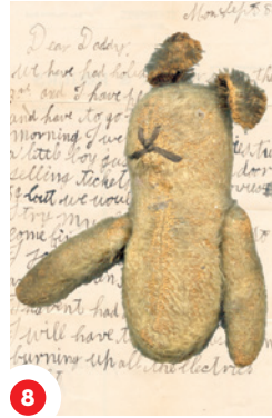
8 Odiminowagan miko