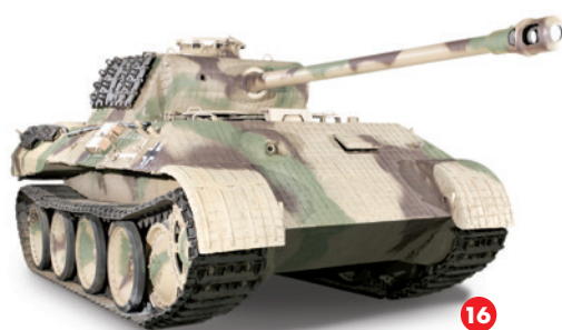
16 Panzerkampfwagen V Panther Ausf A