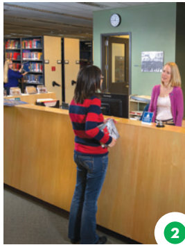
2 Shimaginish winda kenimitc ona