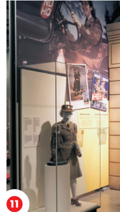
11 Canadian ikwe shimaginish tcibwi