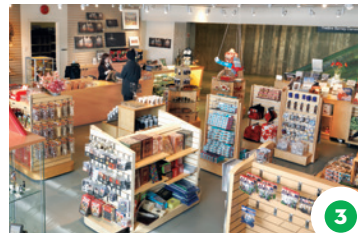
3 Wi kishpinidjigewin