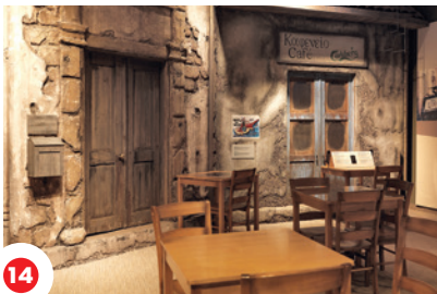
14 Cyprus odenasik