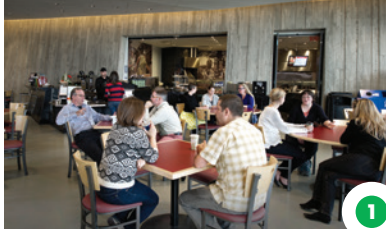
1 Nibishabo migwamik