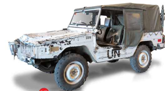
13 Ka nagik waskoneh odaban