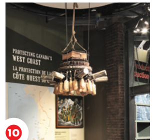
10 Japanese ogitci waweh mosinin