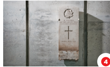
4 Asini oshtigwan shimaginish agwa kagi kendagozitic