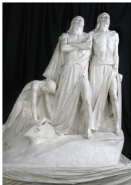
15 Ka Poksidjigadek Kitchi Mokoman, Walter Allward kagi ojbiyak