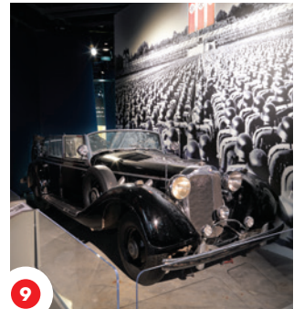
9 Hitler ododaban