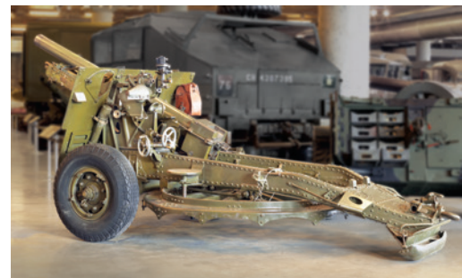
17 Teshigotc ka modehdek 25-pounder Mk II paskizigan