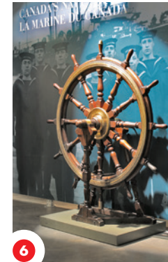
6 HMCS tigwanibisan kitchi tciman minigan