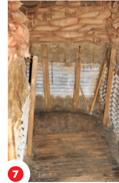
7 Madiziwin eh ija pigoneh dowgak