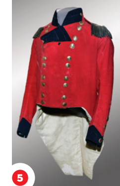
5 Isaac Brock's adehmin